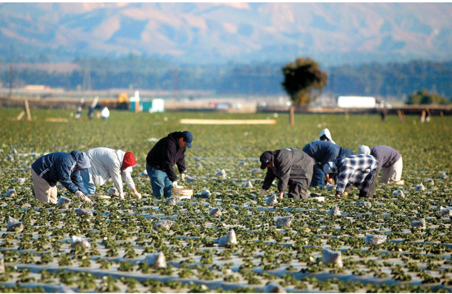
Farmworkers picking strawberries.